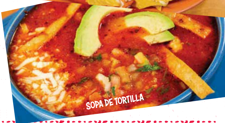
SOPA DE TORTILLA