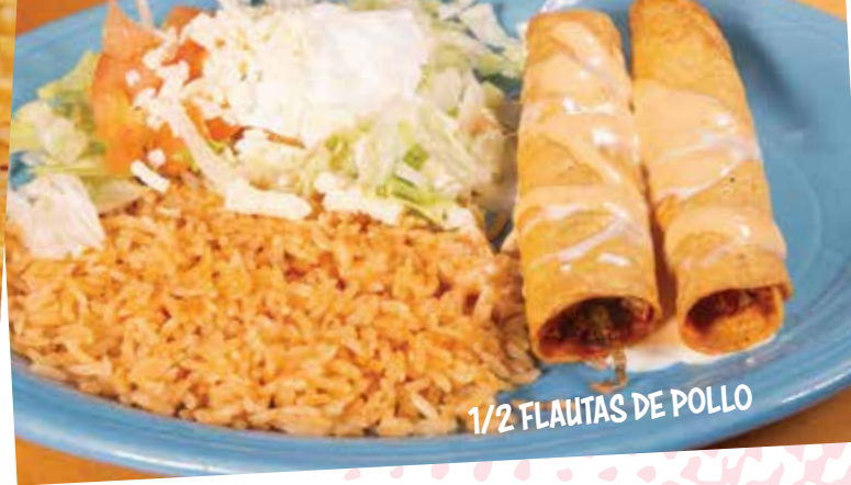
1/2 FLAUTAS DE POLLO