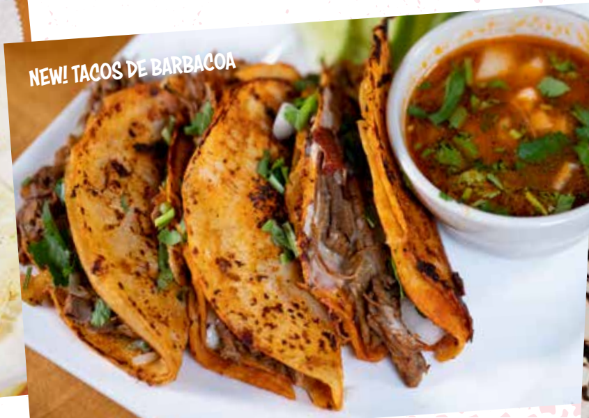
NEW! TACOS DE BARBACOA