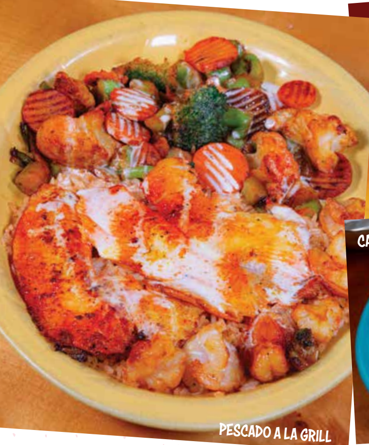
PESCADO A LA GRILL