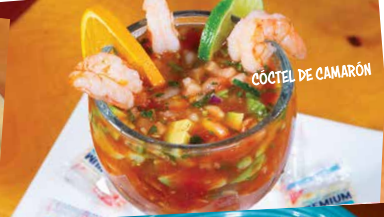
CÓCTEL DE CAMARÓN