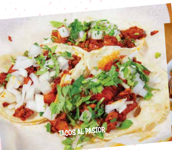
TACOS AL PASTOR

Consumer Advisory: Consumption of raw and undercooked animal food is dangerous to your health. If you request raw or undercooked food you are putting yourself in danger of food-borne illness and take the responsibility upon yourself to order such products.