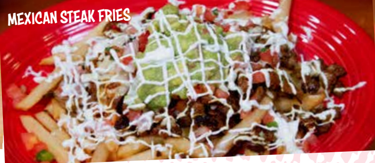
Pictured Habanero's Favorites