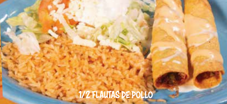
1/2 FLAUTAS DE POLLO