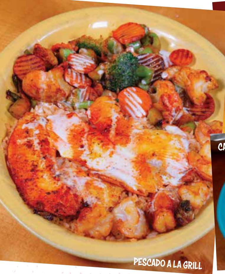
PESCADO A LA GRILL