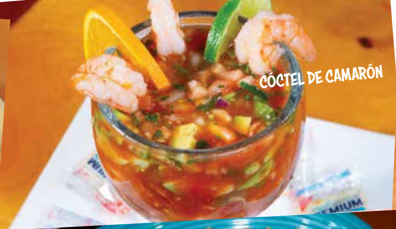
CÓCTEL DE CAMARÓN