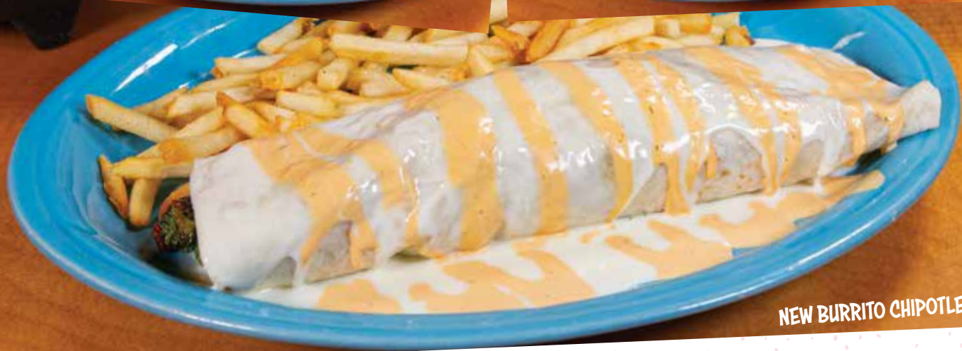
NEW BURRITO CHIPOTLE