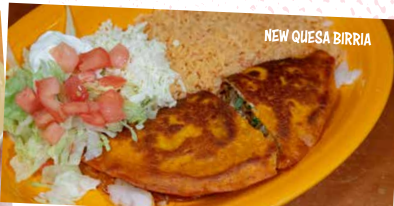
NEW QUESA BIRRIA