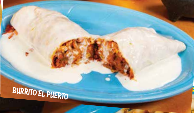
BURRITO EL PUERTO