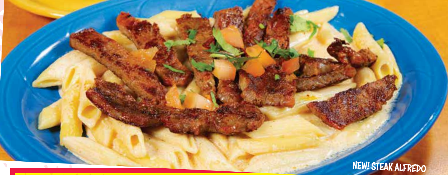
NEW! STEAK ALFREDO