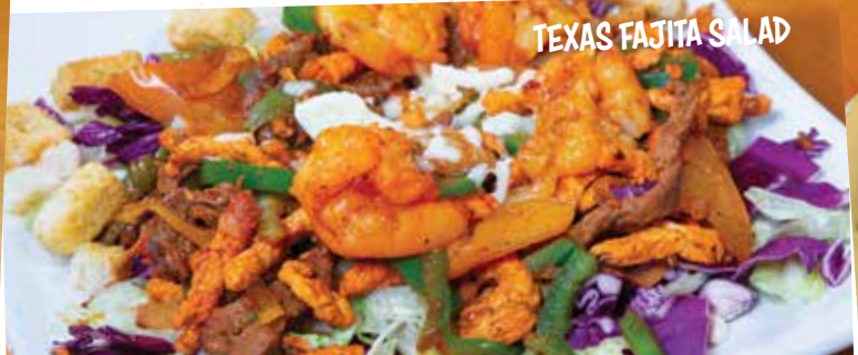
TEXAS FAJITA SALAD

Grilled chicken breast on a bed of lettuce, tomatoes, onions, bell peppers, cucumbers, purple cabbage and croutons. Topped with cheese. 11.99